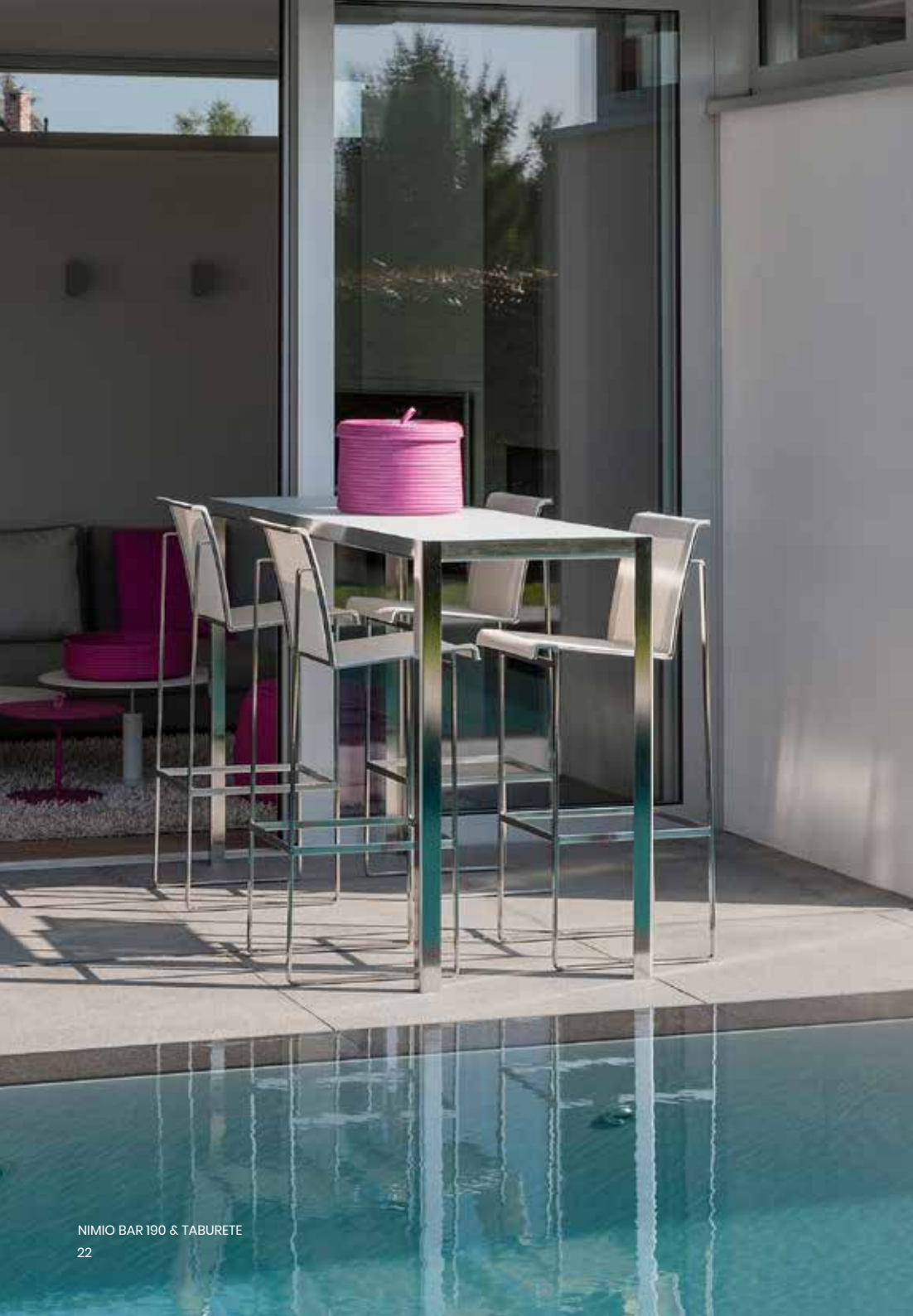
NIMIO BAR 190 & TABURETE