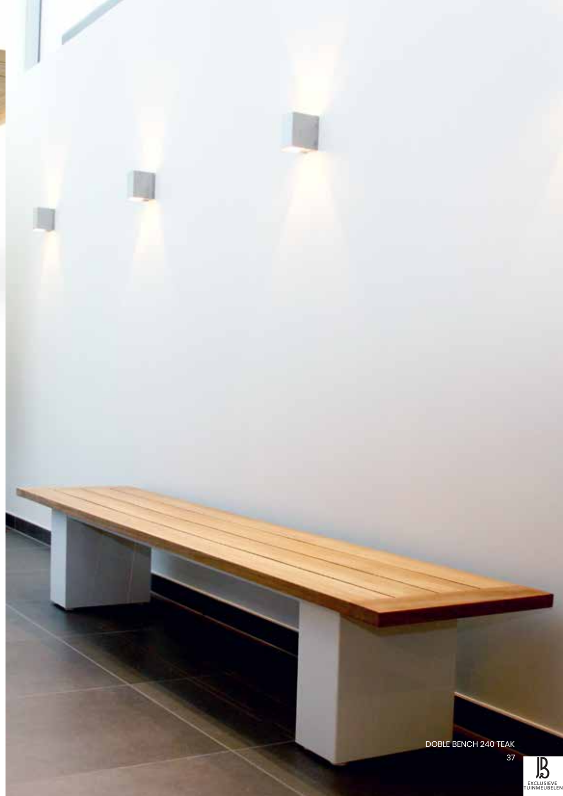
DOBLE BENCH 240 TEAK