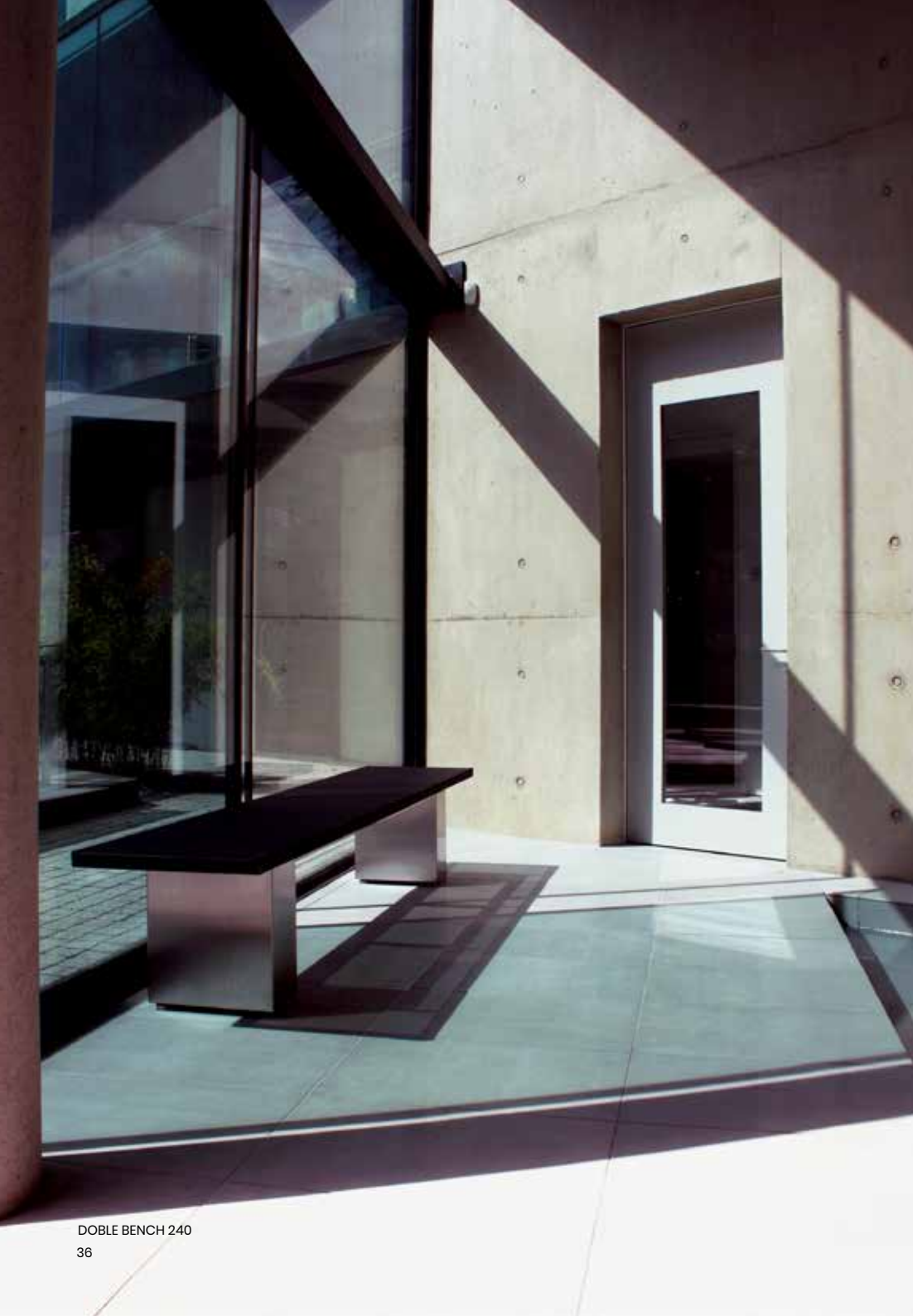
DOBLE BENCH 240