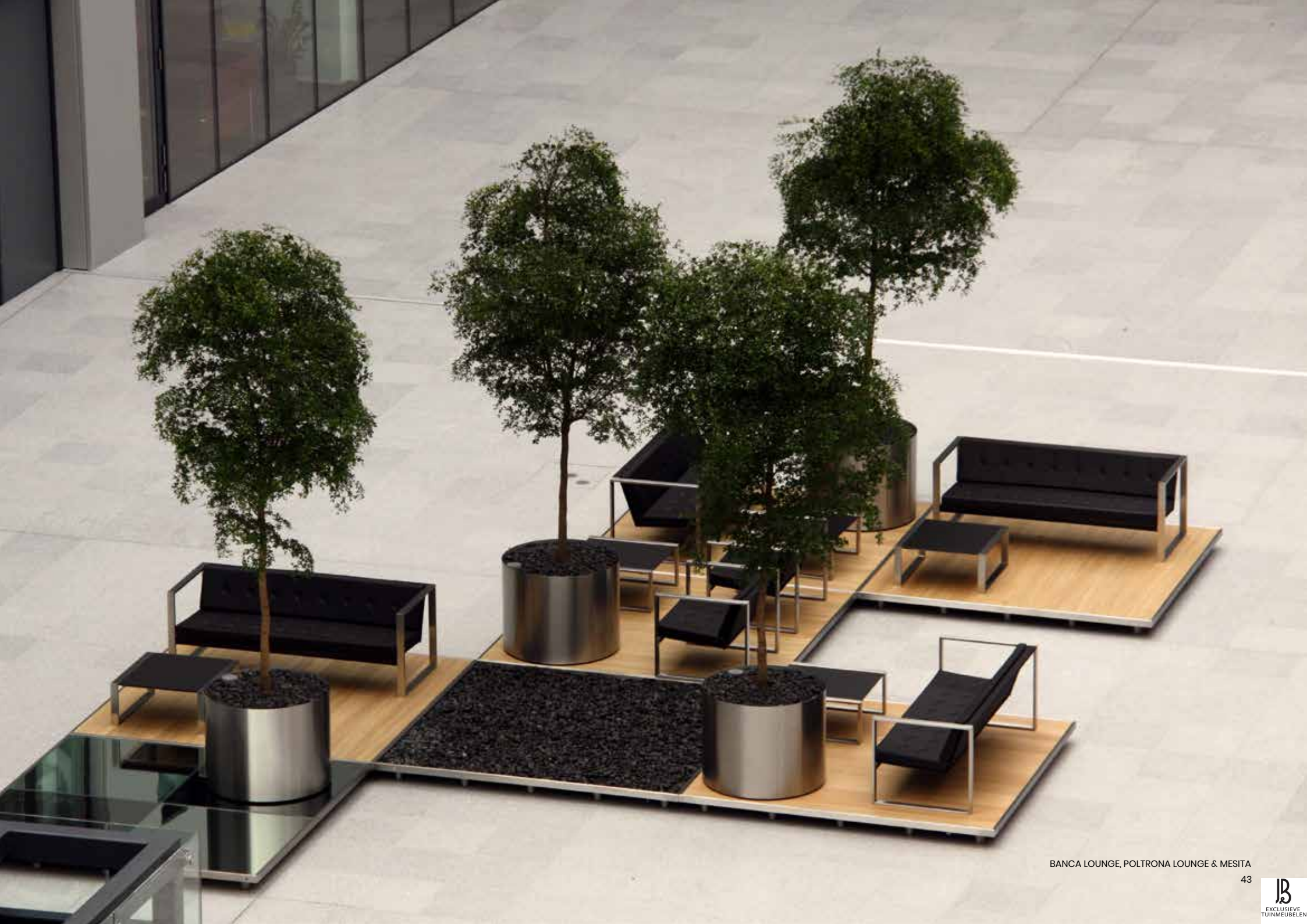
BANCA LOUNGE, POLTRONA LOUNGE & MESITA