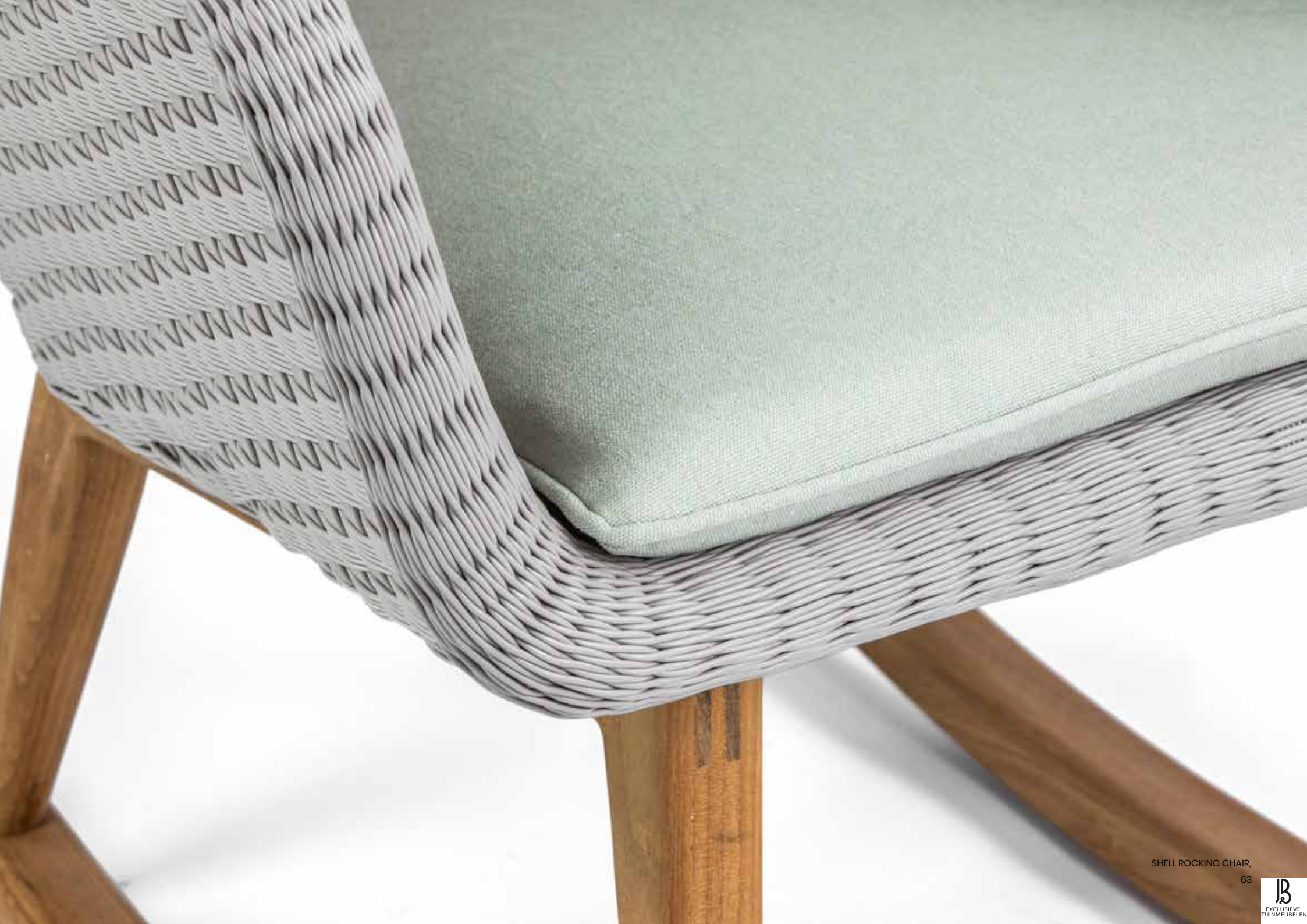
SHELL ROCKING CHAIR.