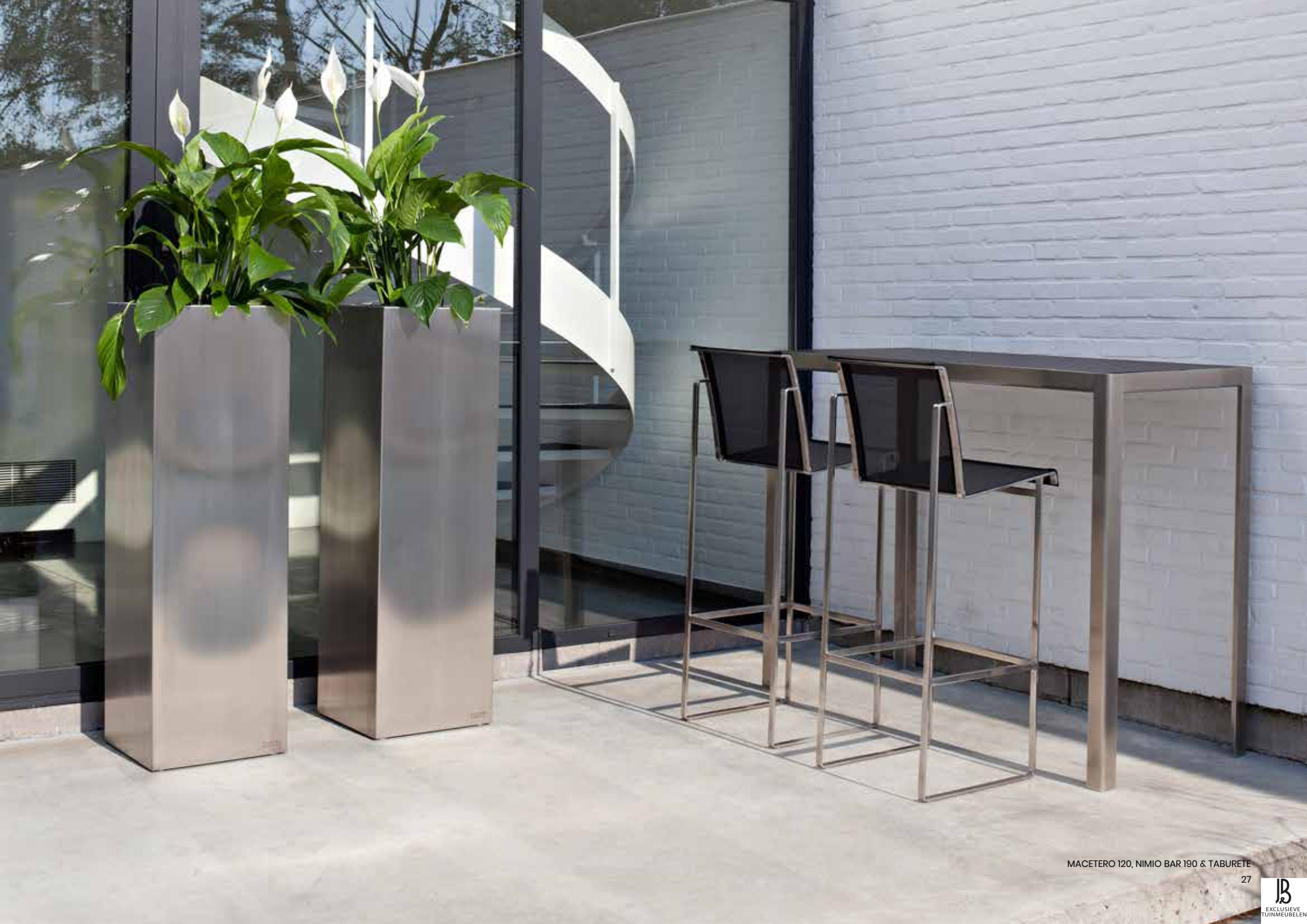
MACETERO 120, NIMIO BAR 190 & TABURETE