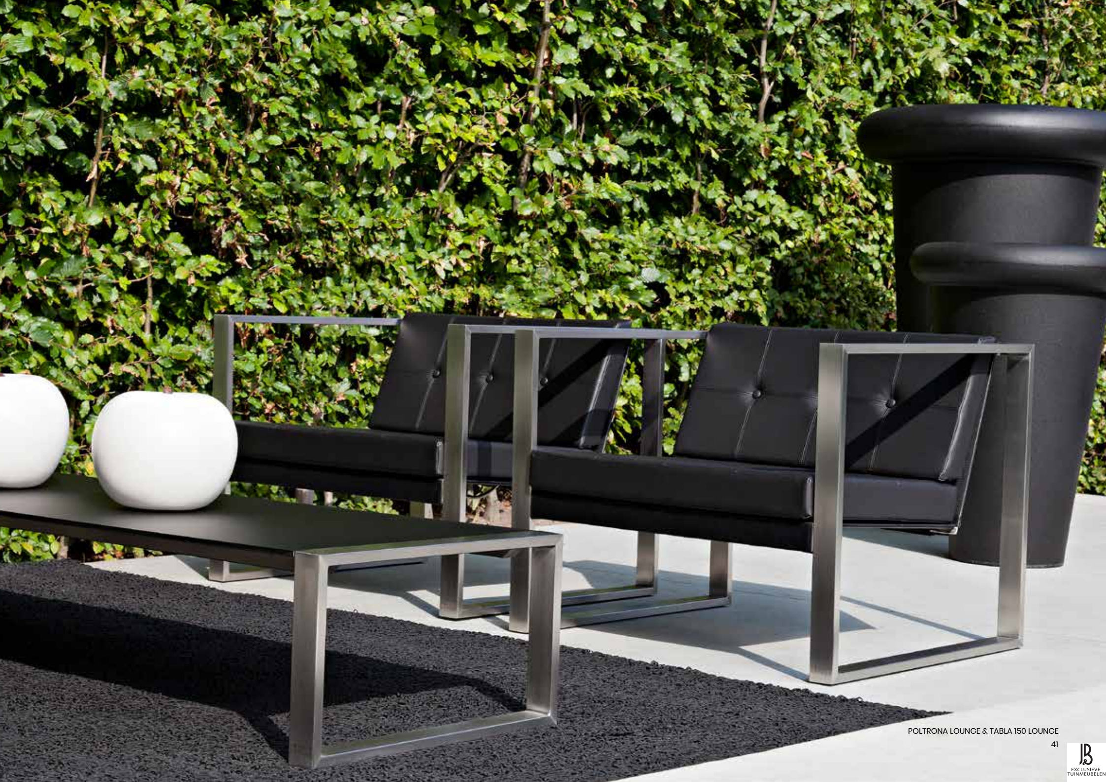
POLTRONA LOUNGE & TABLA 150 LOUNGE