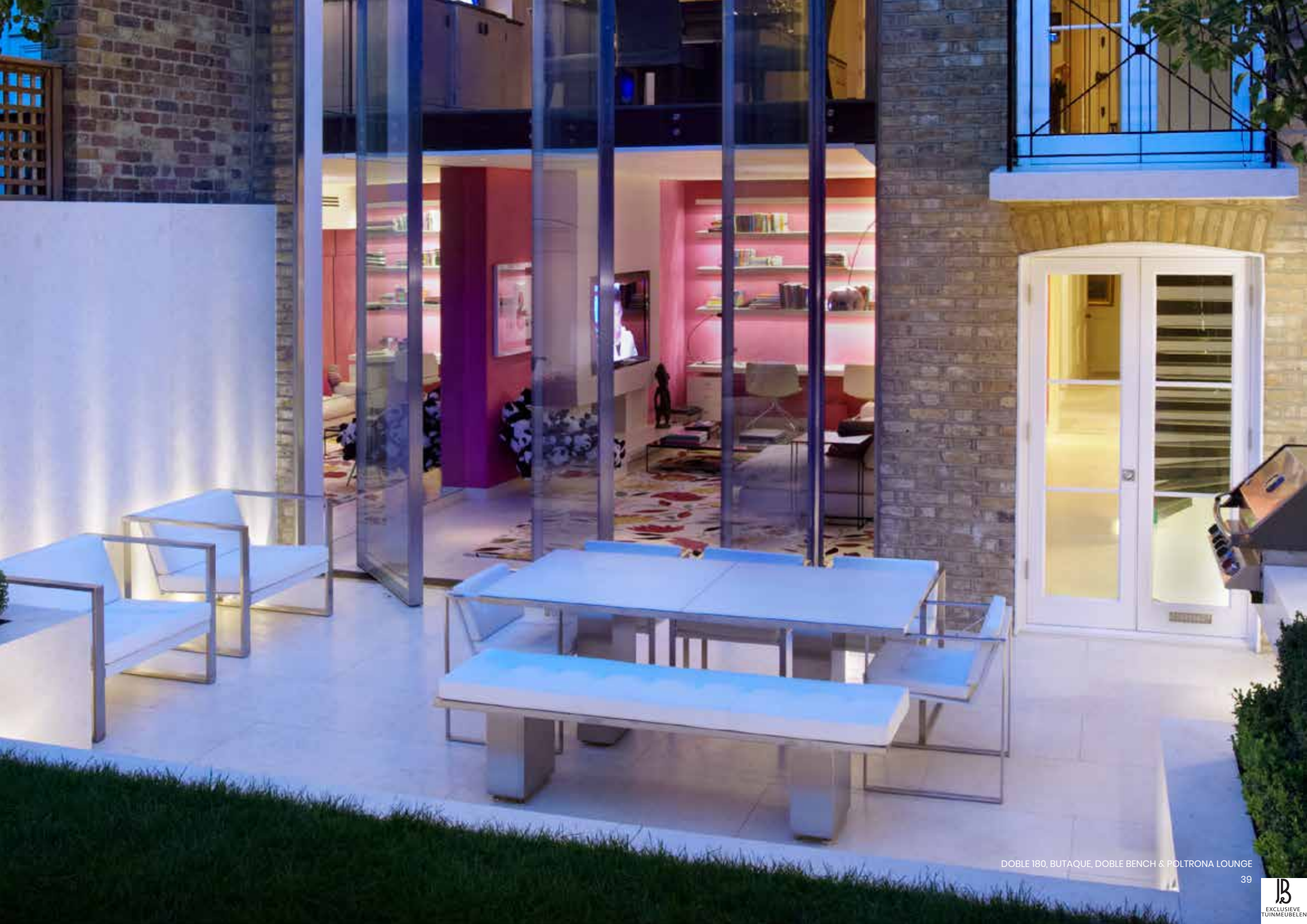
DOBLE 180, BUTAQUE, DOBLE BENCH & POLTRONA LOUNGE