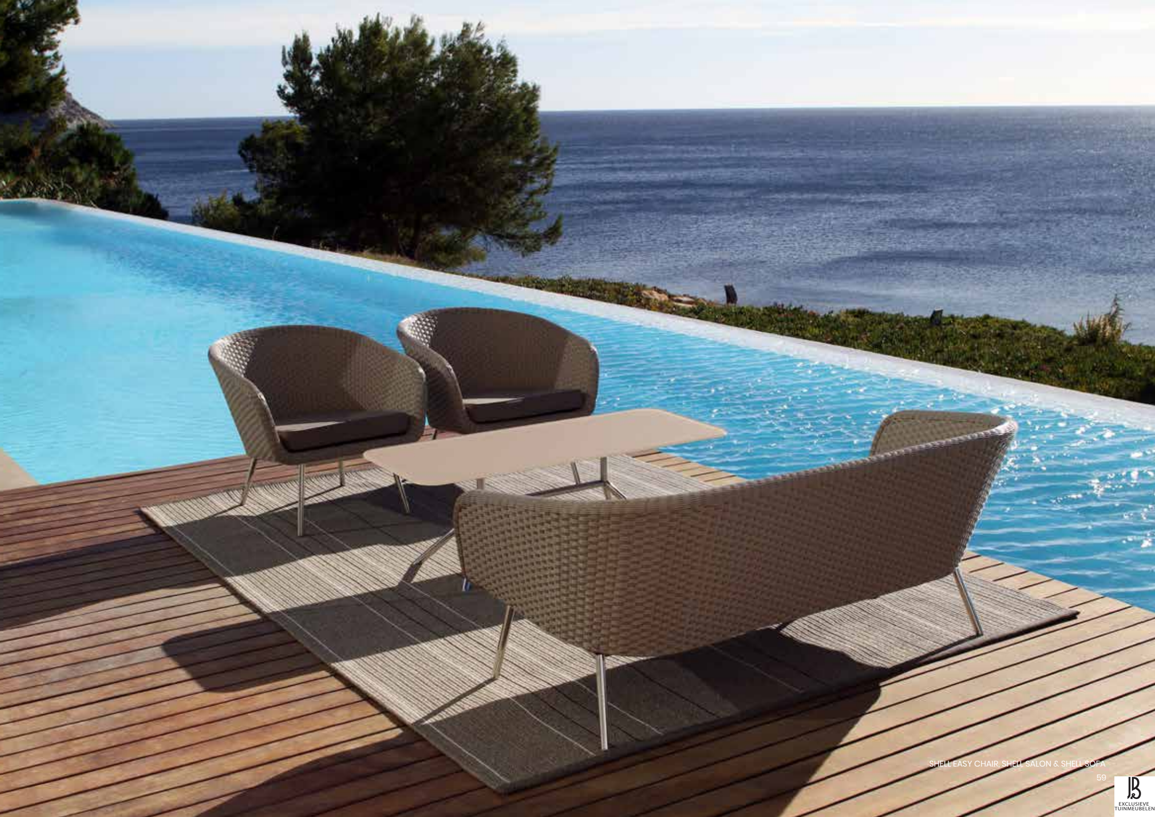
SHELL EASY CHAIR, SHELL SALON & SHELL SOFA