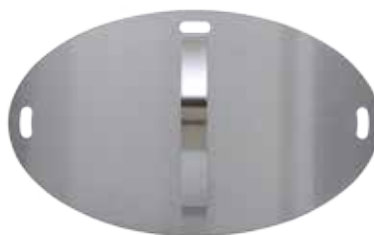
Grill Forno door