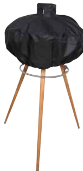
Grill Forno cover