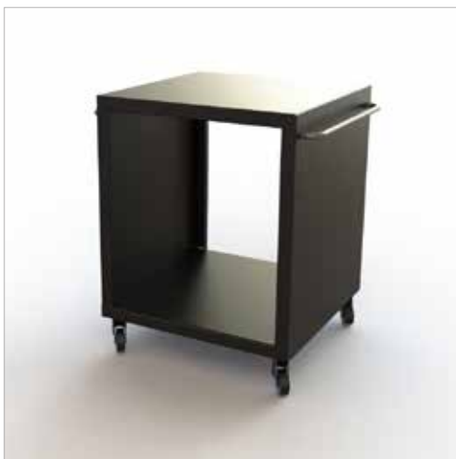
Forno, Outdoor Table - Terra

incl. Forno, Outdoor Table - Terra 60 x 60 cm, Tuscan Grill, Ash Scraper & 3 bags of fuel