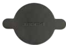
Smokekeeper for Grill Forno & Forno