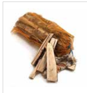
3 bags of fuel