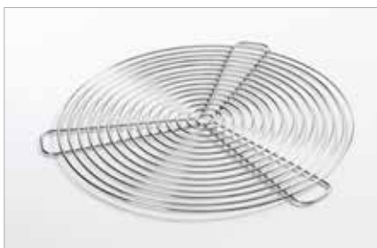
Ignis grill grate

Fire captivates – dancing, hot flames are a natural meeting place, promoting calm, contemplation and comfort.