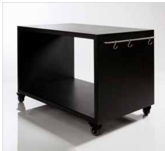
Forno, Outdoor Table - Garden