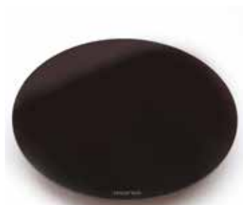
VETRO - Pizza- & Cooking plate