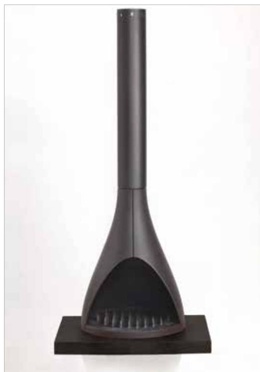
MORSØ KAMINO - w/o base